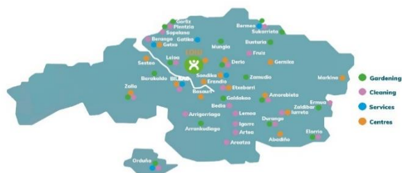
Figure 1. Map showing the presence of Lantegi Batuak work centres in the Province of Biscay

The Lantegi Batuak Foundation currently has 22 centers covering the entire province of Biscay. These centers are organized by activities or areas (industrial and services) and a general support center for all activities. The following map shows the distribution and location of the Lantegi Batuak centers in the province.