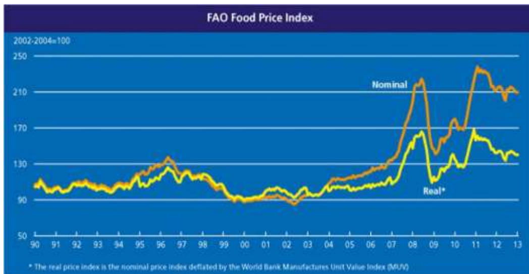
Figure no. 1: The evolution of the FAO Food Price Index