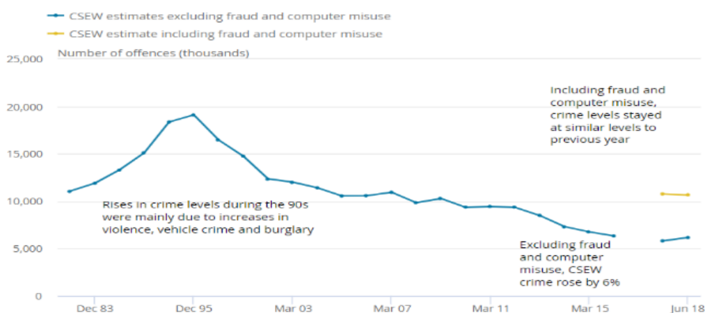
Chart 2 Crime rate evolution in UK, 1983-2018

Source: Office for National Statistics, 2019